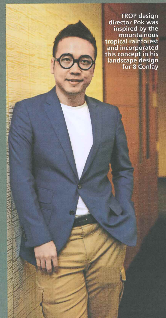
TROP design director Pok was inspired by the mountainous tropical rainforest and incorporated this concept in his landscape design for 8 Conlay

Pok will also be working on the 9th floor separating the hotel and retail components. A series of landscape designs combine with the water features to emulate the concept of a waterfall using trees that are local, practical and easy-to-maintain to promote sustainability.