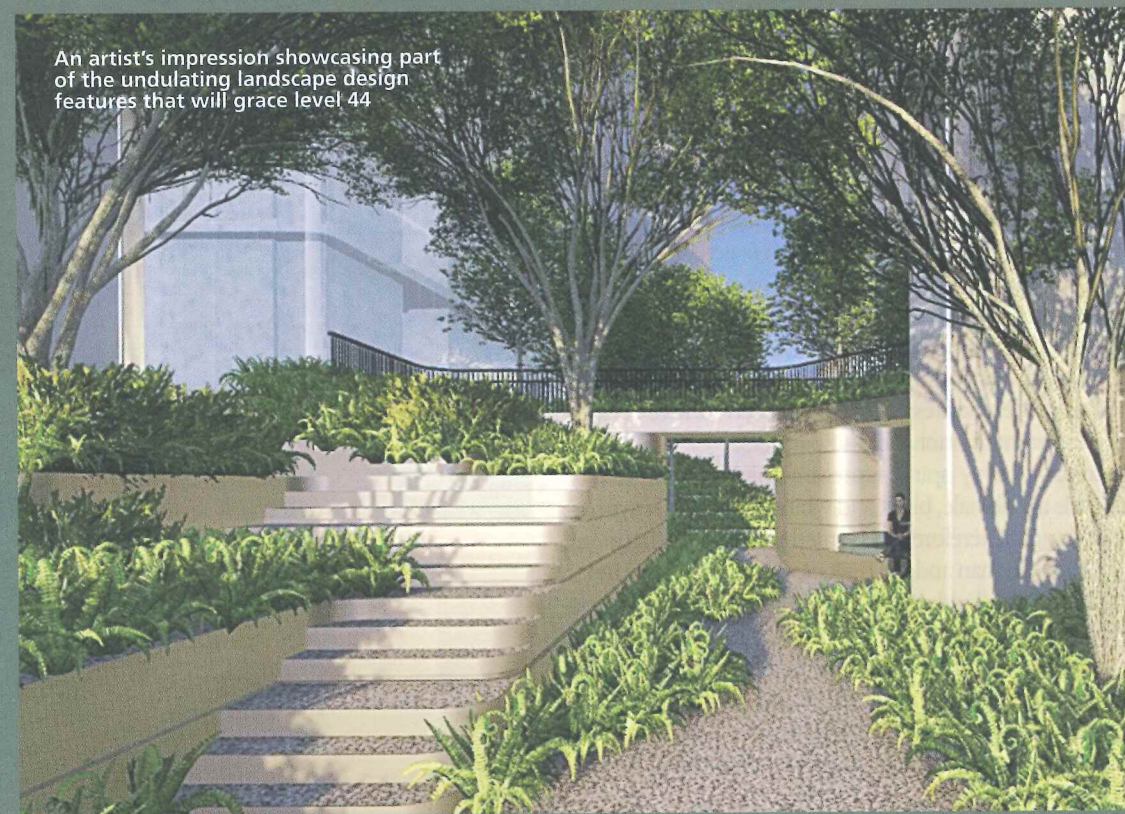
An artist's impression showcasing part of the undulating landscape design features that will grace level 44

BANGKOK-based design director Pok Kobkongsanti of TROP (Terrains + Open Space), the renowned landscape design firm from Thailand was included in the initial stages of the planning details for 8 Conlay.