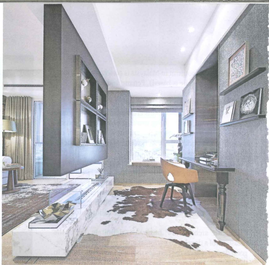
ABOVE: The well-designed interiors of the YOO Hong Kong Residences.