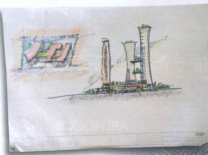
Hud's artistic sketches for the swirling towers of 8 Conlay marrying two connected platforms on levels 26 and 44. (Top right) The architect with his masterpiece creation