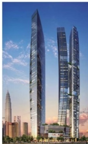
8 Conlay comprises two towers of branded residences, a hotel tower and a retail podium