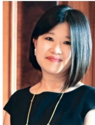
Kua: We want to deliver a lifestyle that people aspire to have

8 Conlay was designed by renowned Malaysian architect Hud Bakar of RSP Architects in KL. Hud is the designer behind many of the landmarks in KL such as Felda Tower, Paradigm Mall and Matrade Exhibition and Convention Centre.