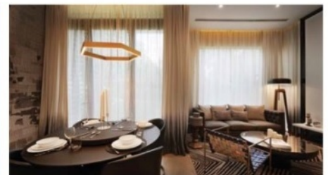
Showflat showing the living and dining space of a two-bedroom unit